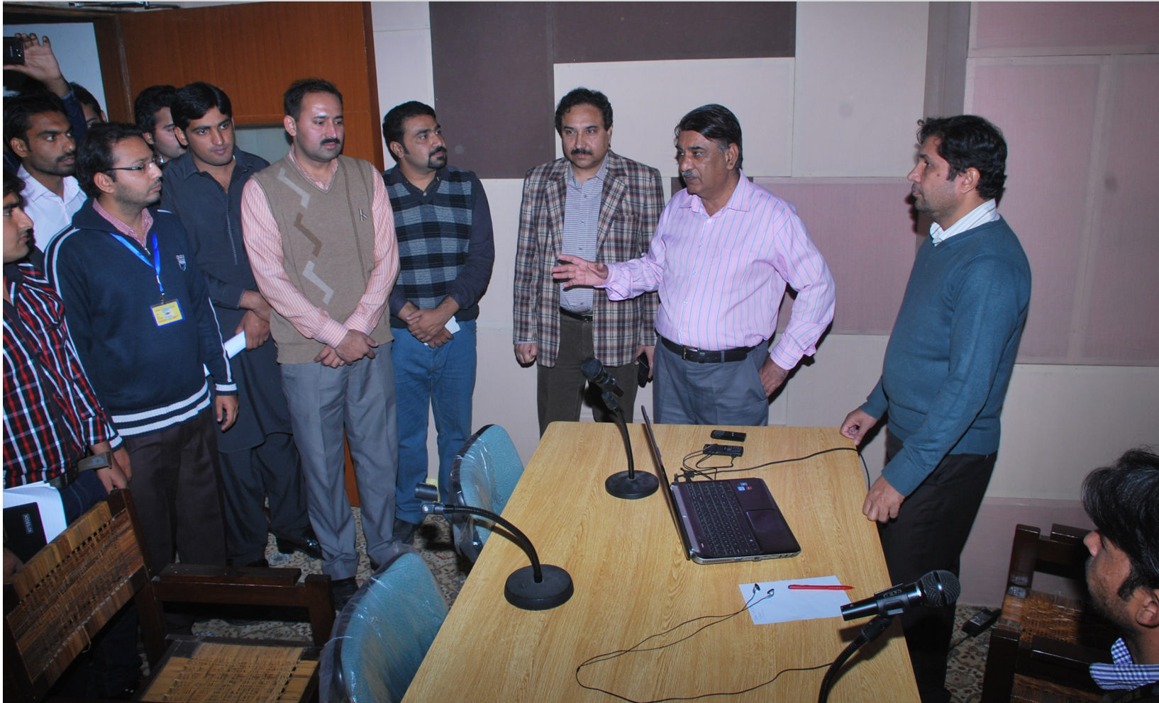
Training of students concerning developing and broadcasting FM radio messages in progress